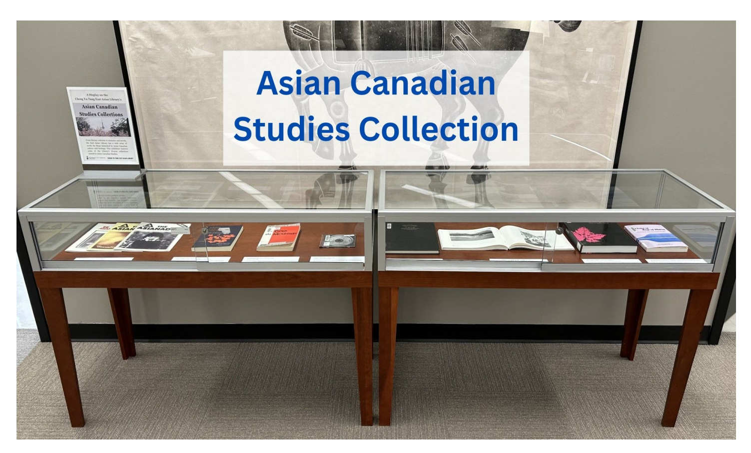
Above: Current Display on the East Asian Library's Asian Canadian Studies Collection

The event exemplified the power of dialogue and community engagement, leaving a lasting impact on all those who attended. As we move forward, the East Asian Library remains dedicated to fostering meaningful conversations within our community and continuously illuminating the diverse and dynamic Asian Canadian experience.