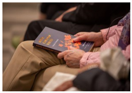
Above: Image of the book, Asian Canadian Voices: Facets of Diversity