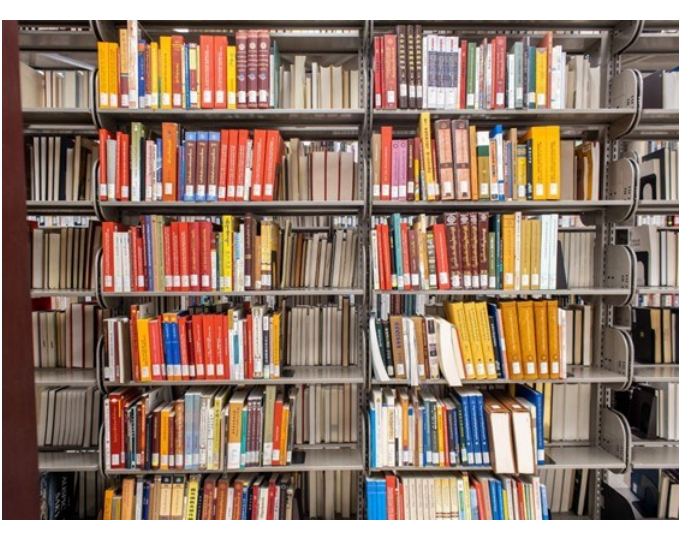
Above: Tibetan Collection shelved in the Cheng Yu Tung East Asian Library's open stacks

W ith the University of Toronto hosting Canada's premier Tibetan Studies program and Toronto being home to one of the largest Tibetan communities outside of Asia, in 2013, the University of Toronto Libraries (UTL) initiated a transformative partnership with Columbia University Library to develop our Tibetan Studies collection. This collaboration has now reached its remarkable 10th year, making a significant contribution to supporting the Tibetan Studies program at the University of Toronto and beyond.