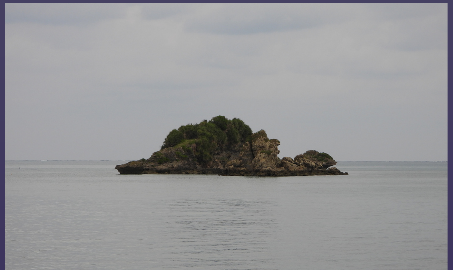
Satoko Nema, "Island of Reverberation", 2023

| Photobook workshop | Flexible learning space, Cheng Yu Tung East Asian Library