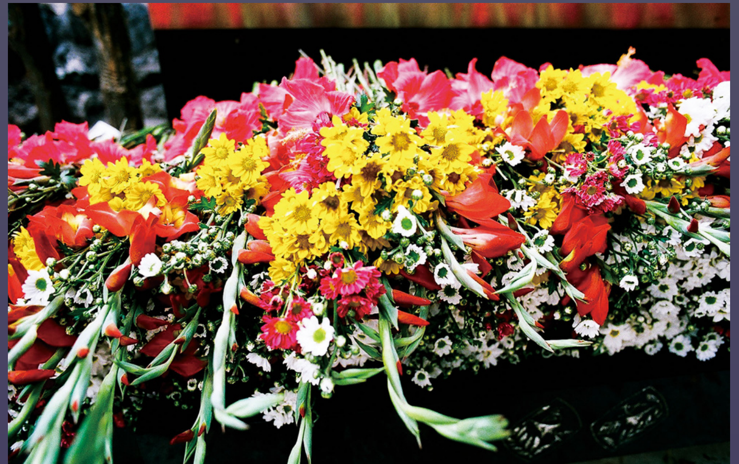
Kaori Nakasone, from the series Temporality , 2023