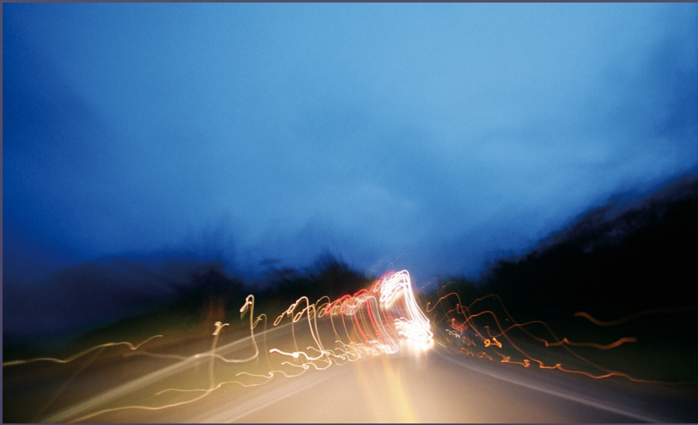
Kaori Nakasone, from the series Temporality , 2023