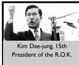
Kim Dae-jung, 15th President of the R.O.K.

4) Networking: some documents trace the progress of coalition-building and grass-root movement about human rights. Internal communiqué published by religious organizations intensified interaction between concerned citizens outside South Korea.