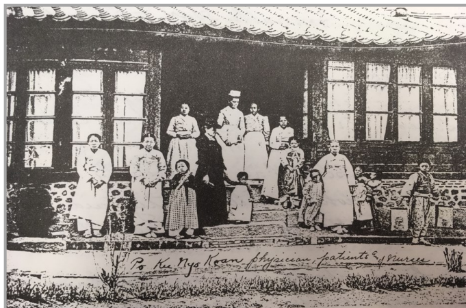
Bo Ku Nyo Koan, Women's Hospital of the Woman's Foreign Missionary Society (W.F.M.S.). 1905.

The East Asian Library has acquired the 20-volume