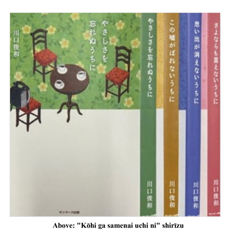
(Image credit: Fabiano Rocha; Dust jacket design © Sanmāku Shuppan)

EAL also co-presented with the Japan Foundation, Toronto, a film screening of コーヒーが冷めないうちに ( Before the Coffee Gets Cold , 2018) – a movie adaption of Kawaguchi's first novel that was also adapted from the original play with the same title. The event was held at the Innis Town Hall on September 28, 2024. Over 200 people were in attendance.