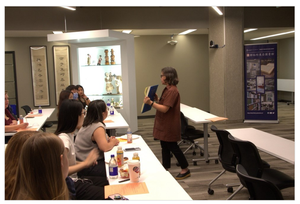
Above: Orientation for the U of T Tibetan Studies Students on September 25, 2024

As the 2024 Fall Session began, we were excited to welcome both new and returning students in East Asia-related fields. In late August, we hosted an in-person library orientation and tour specifically for incoming graduate students in East Asian Studies. Led by EAL librarians, the session was designed to address the diverse academic and research needs of our students. In September, we expanded our offerings with an in-person Tibetan Studies library orientation for both undergraduate and graduate students, which included a comprehensive overview of the specialized resources available in Tibetan Studies.