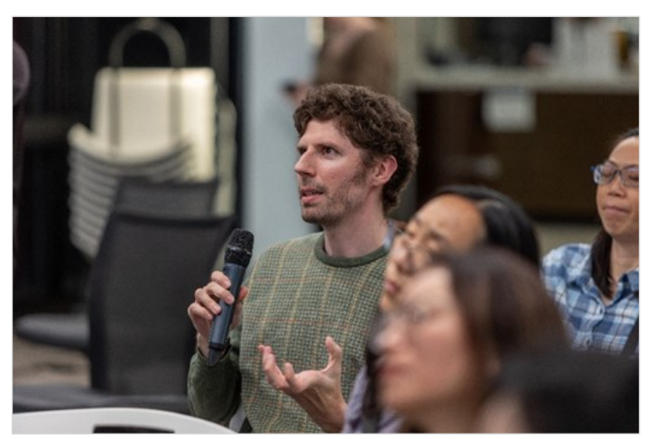
Above: Audience members asking questions during the Q & A

In this event, faculty, undergraduate and graduate students in East Asian Studies, as well as those in the Study of Religion, History, and other related fields, along with library staff, actively participated, engaging in thoughtful discussions and asking many insightful questions.