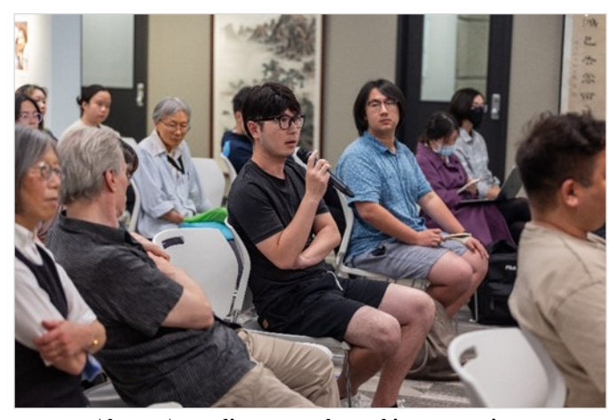
Above: An audience member asking a question during the Q & A