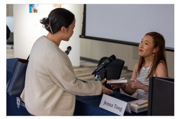
Above: During the book signing session