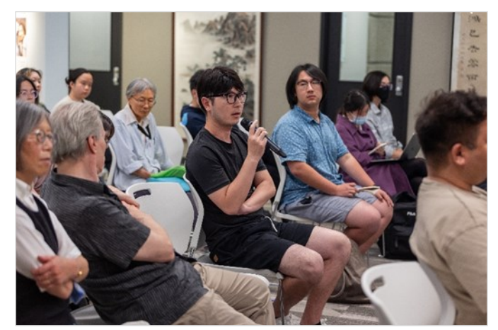
Above: An audience member asking a question during the Q & A