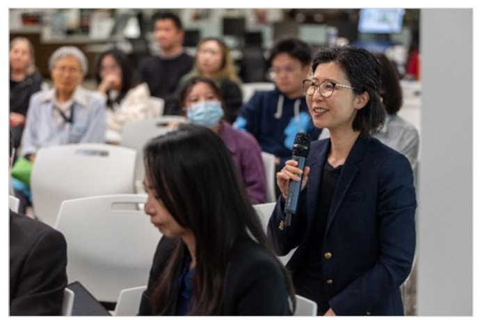
Above: An audience member asking a question during the Q & A