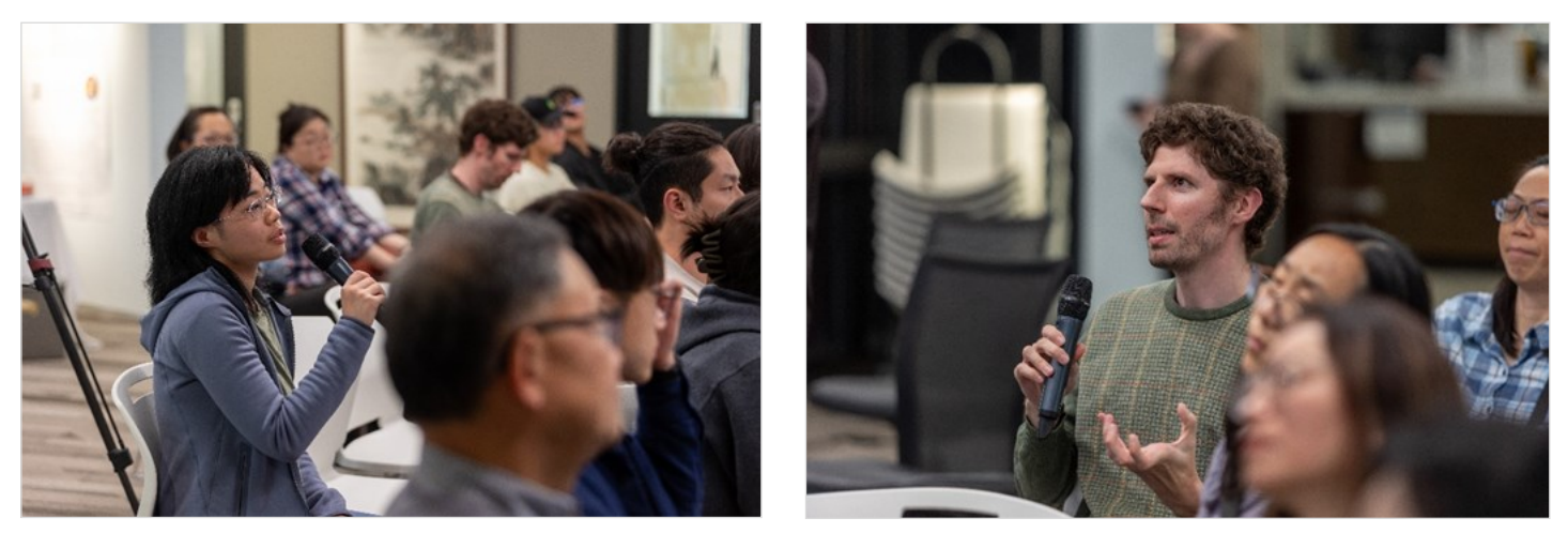
Above: Audience members asking questions during the Q & A