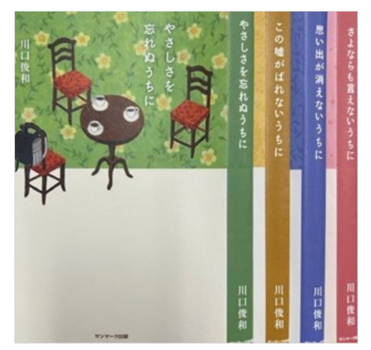
Above: "Kōhi ga samenai uchi ni" shirīzu (Image credit: Fabiano Rocha; Dust jacket design © Sanmāku Shuppan)

EAL also co-presented with the Japan Foundation, Toronto, a film screening of コーヒーが冷めないうちに ( Before the Coffee Gets Cold , 2018) – a movie adaption of Kawaguchi's first novel that was also adapted from the original play with the same title. The event was held at the Innis Town Hall on September 28, 2024. Over 200 people were in attendance. (F. Rocha)