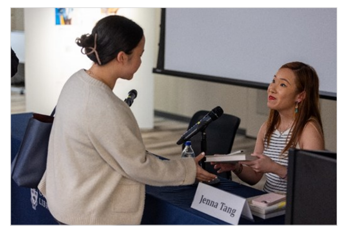
Above: During the book signing session