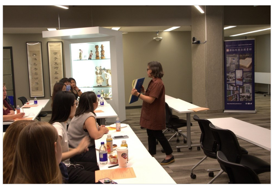
Above: Orientation for the U of T Tibetan Studies Students on September 25, 2024

As the 2024 Fall session began, we were excited to welcome both new and returning students in East Asiarelated fields. In late August, we hosted an in-person library orientation and tour specifically for incoming graduate students in East Asian Studies. Led by EAL librarians, the session was designed to address the diverse academic and research needs of our students. In September, we expanded our offerings with an inperson Tibetan Studies library orientation for both undergraduate and graduate students, which included a comprehensive overview of the specialized resources available in Tibetan Studies.