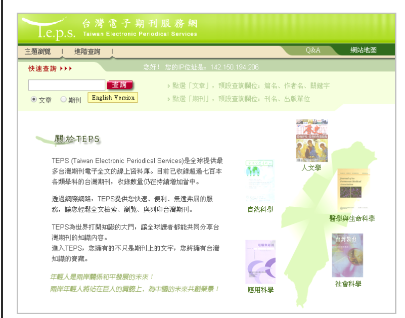
Front page of Taiwan Electronic Periodical Services (TEPS)