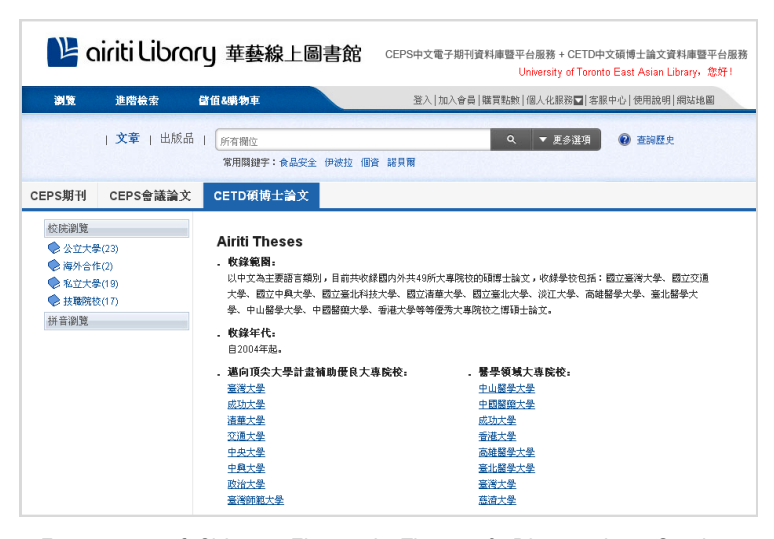
Front page of Chinese Electronic Theses & Dissertations Service

CETD covers more than 200,000 full-text theses and dissertations. The interface of this database is in Chinese. However, users can still input English terms to perform a search. Besides a list of titles of dissertations or theses, the database also allows search results to be sorted by institution, date, type of degree, region and language.